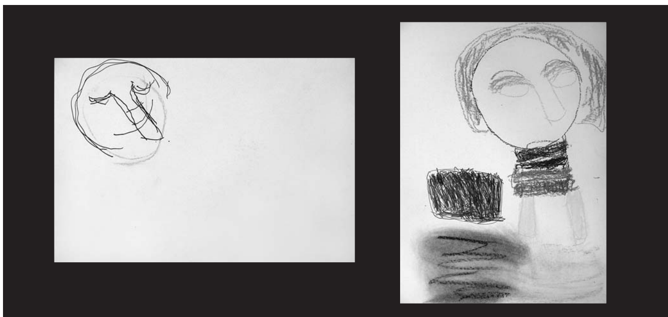
Figure 2 Before and After Self-Portrait